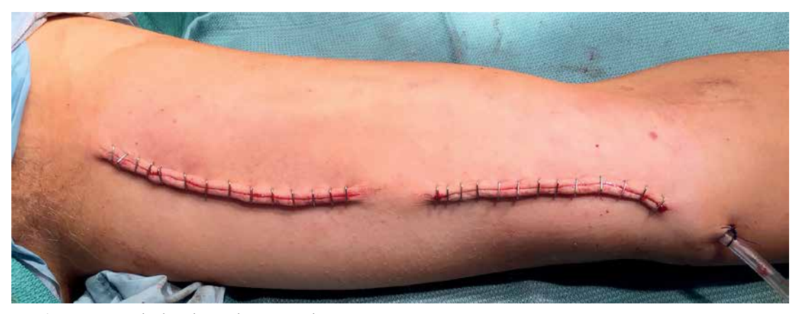
Figure 5. Wounds closed over the suction drainage

be performed during AVF creation (one-stage procedure) or may follow the AVF maturation (twostage procedure, when the first stage is a brachiobasilic arteriovenous anastomosis) [11-14]. The definitive answer to the question of whether one-stage or two-stage technique is optimal is still uncertain and needs a large randomized prospective study. Authors emphasize that maturation, patency, failure and complication rates may suggest equivalence of both techniques. However, it is also emphasized that the strength of the evidence is limited [13, 15–17]. Some authors report that the one-stage technique decreases the time of maturation and the time to the first cannulation. This technique also minimizes the risk of catheter-related infections, since it shortens the time of catheter-based HD [13]. The two-stage procedure is recommended if the basilic vein is less than