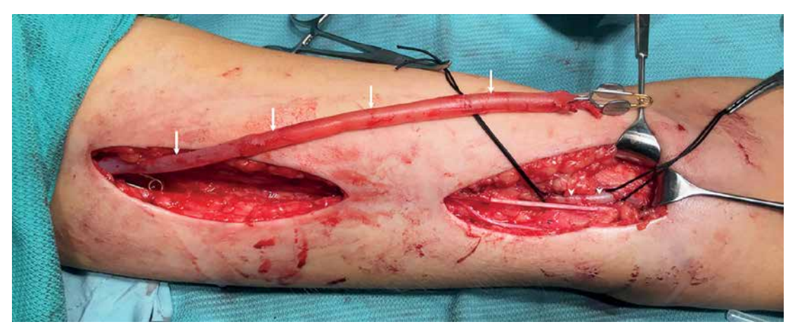
Figure 3. Basilic vein (arrows) with ligated collaterals, dilated with 0.9% saline solution and exposed brachial artery (arrowheads) in the ulnar fossa

on the 3<sup>rd</sup> day. The AVF cannulation was attempted 6 weeks later.