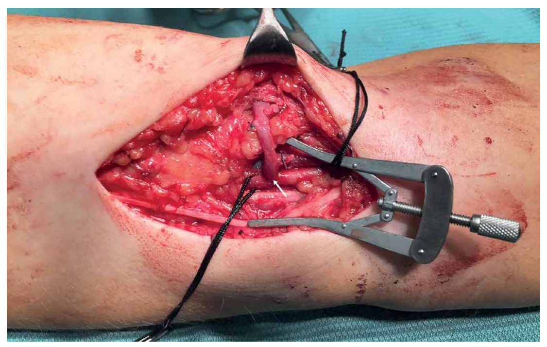
Figure 4. Arteriovenous anastomosis (side of brachial artery - end of basilic vein) (arrow)